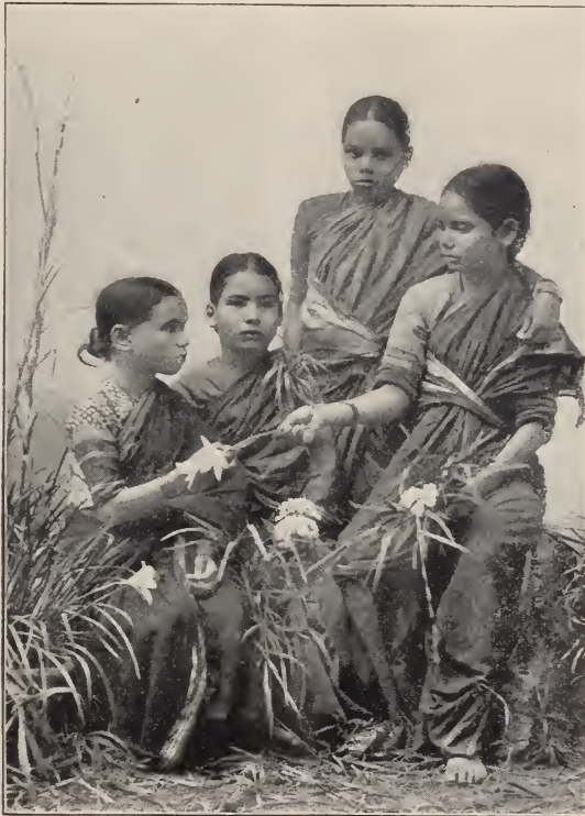
A GROUP OF HINDU WIDOWS

The docile child will not forget the lessons she learned so eagerly at school; but she will be far from any help. How is she to fight those deadly superstitions? And far away in the little village there will be no one, not one , to bid her trust her Father in heaven and Jesus her Saviour, who love her and her child.